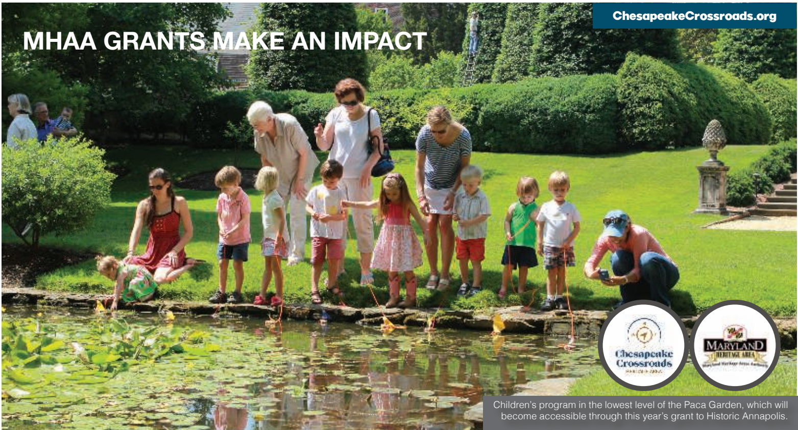
Children's program in the lowest level of the Paca Garden, which will become accessible through this year's grant to Historic Annapolis.