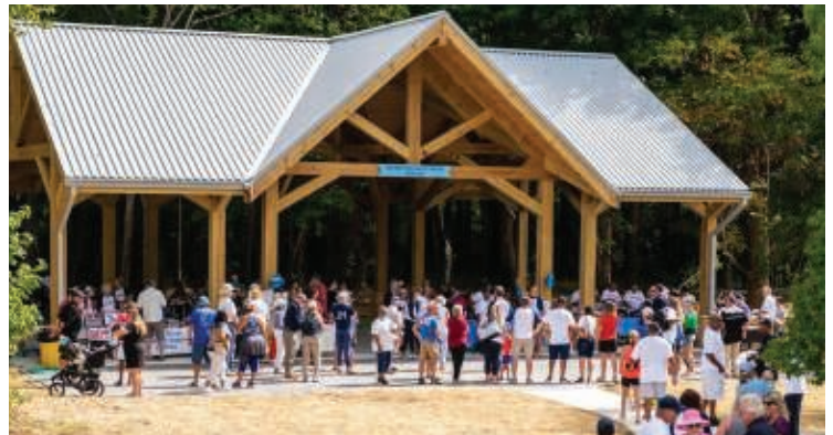
Hot Sox Ballfield and Michael E. Busch Pavilion Opening Event.