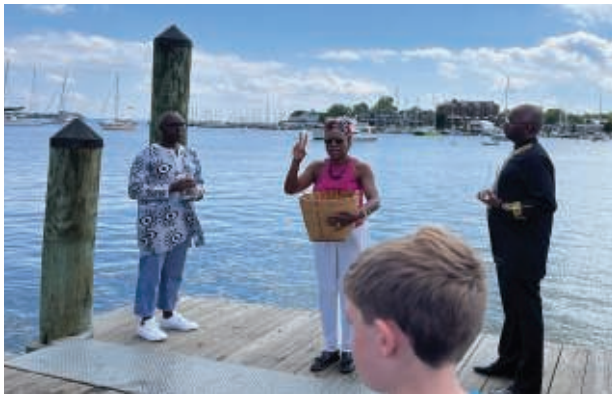
Ceremony for the International Day of Remembrance of the Victims of Slavery and the Transatlantic Slave Trade held at Annapolis City Dock.