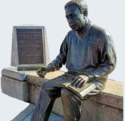
Kunta Kinte-Alex Haley Memorial