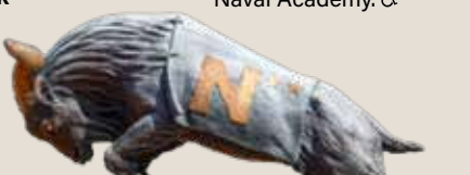
USNA Visitor Center