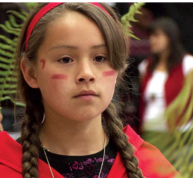
Lummi Nation First Salmon Ceremony, 2010.