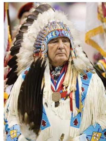
United States Senator Ben Nighthorse Campbell (Northern Cheyenne), 2005.