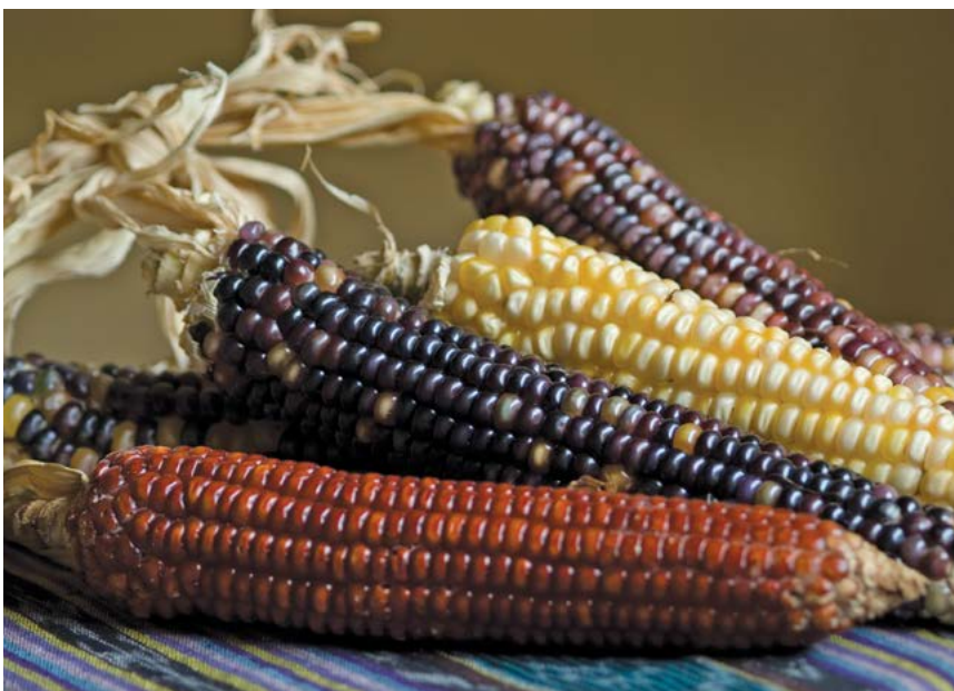
Guatemalan corn.