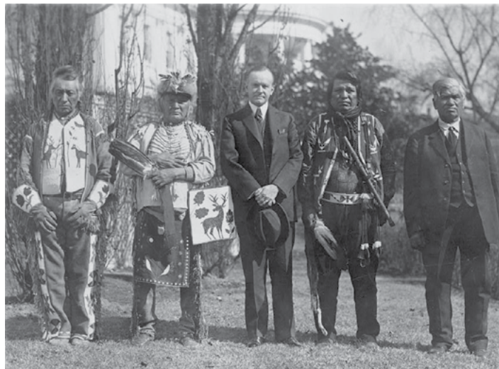
President Calvin Coolidge with Native delegation, 1925.