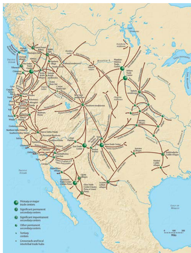
North American Indian Trade Routes.