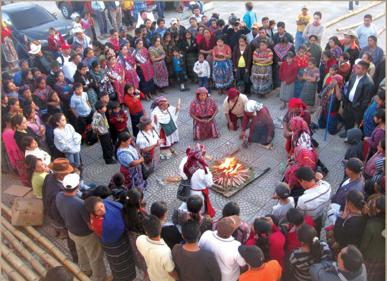
Maya ceremony, 2011.

www.AmericanIndian.si.edu/explore/foreducatorsstudents