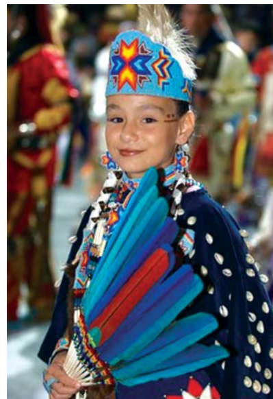
Young powwow dancer, 2007.