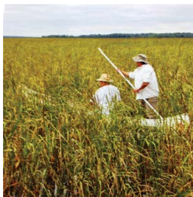
(Left to right) Saguaro and prickly pear cactuses on the Sonoran Desert, 2004. Wild rice harvesting, 2010. Leech Lake, Minnesota.