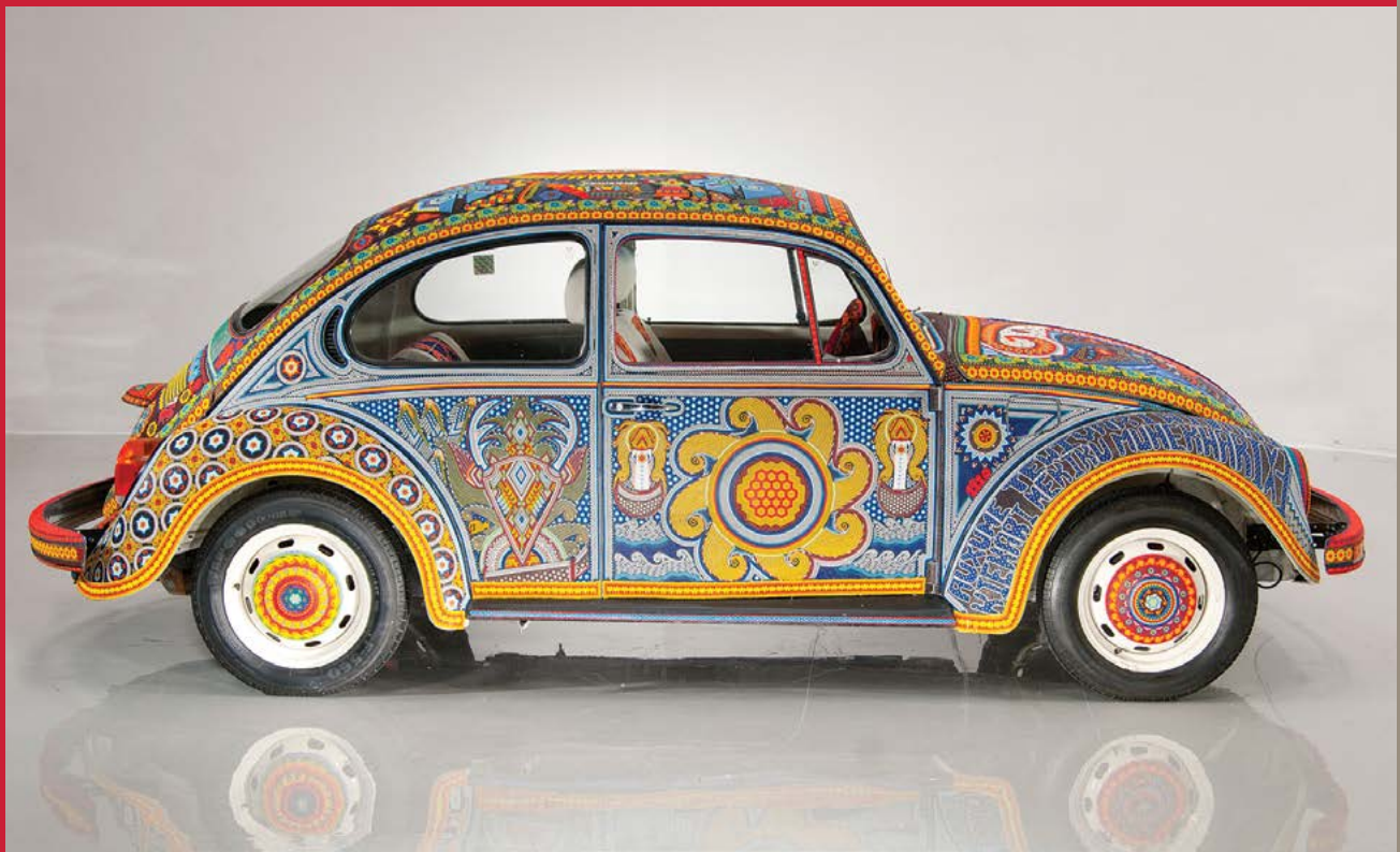
Volkswagen Beetle named "Vochol," decorated by Huichol (Wixaritari) artists using more than 2 million glass beads, 2006.