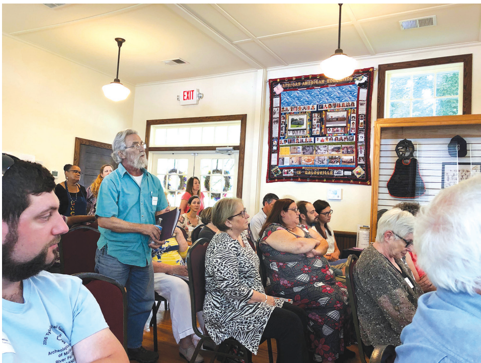
Audience members shared their questions and insights