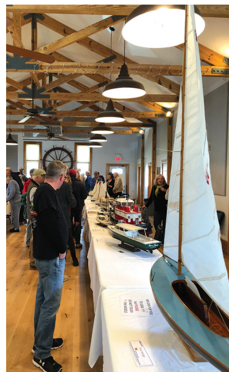
Wooden boat models displayed at the Galesville Memorial Hall (Deale and Galesville)

www.marylandday.org . Again this year, Towne Transport offered FREE transportation around Annapolis on Saturday, traveling a loop with ten stops. Many thanks to all who combined efforts to make the event a big success!