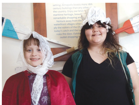
Girls visit the "colonial photo booth" at the Visit Annapolis Visitors Center