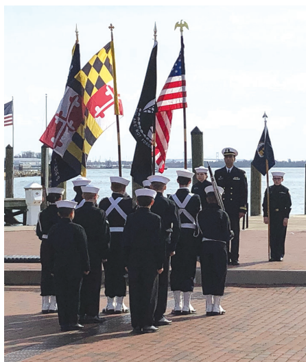
League Cadets of the Training Ship Mercedes perform at City Dock

Four Rivers is a 501 (c) 3, charitable non-profit organization. Your contribution supports the heritage sites and organizations that make a difference to our region's quality of life.