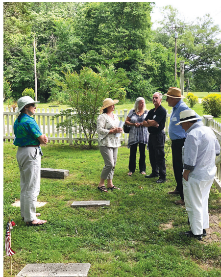
Touring the Quaker Burying Ground

Calvert County joined the conversation with additional insights. Four Rivers thanks all involved for a terrific day of information, resources, and support for the important work of preserving our community cemeteries!