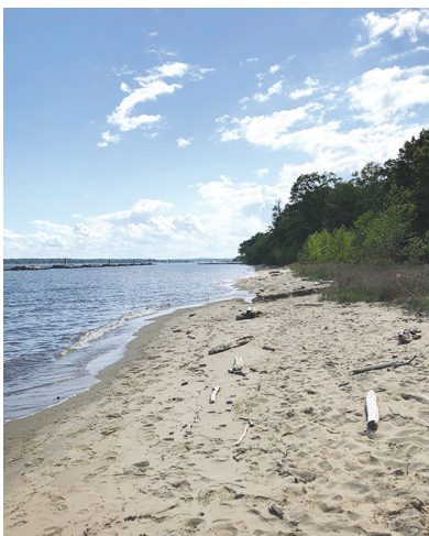
Beverly Triton Park

Are you a “Cartop Boater”? There are more places than ever where you can launch (check out our website for details). Even if you don’t have your own kayak or paddle board, there are outfitters available at several of our local waterfront parks, for an hour or two of pure escape. If you have time, there are boat tours out of Annapolis that offer a different perspective of local history and heritage.