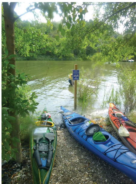
Pictured: Discovery Village

at Discovery Village in August 2018. In addition to launching your cartop boat or trailered boat at Discovery Village, you can picnic under the shade trees, walk your dog, birdwatch and fish from the bulkheads on Parrish Creek.