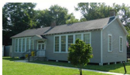
Galesville Community Center Organization, Inc.