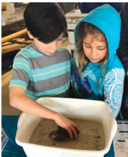
Activities at Annapolis Maritime Museum

Please remember the Four Rivers Heritage Area (legal name ALTSCHA, Inc.) in your charitable donations. Visit our website, www.fourriversheritage.org/support for details on how you can support the organization.