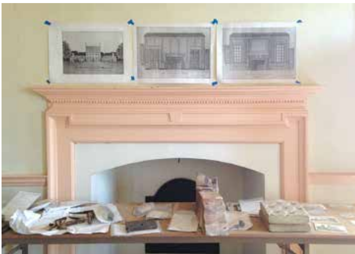
Brice House detail

May is Preservation Month! Four Rivers celebrates this month by acknowledging the hard work of our partners in undertaking capital improvement and preservation projects that will result in an enhanced heritage tourism experience in our area. These projects include: