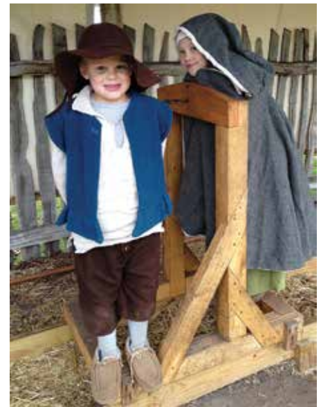
Experiencing colonial life at Historic London Town and Gardens