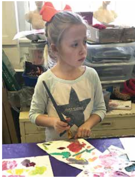
Painting at Maryland Hall