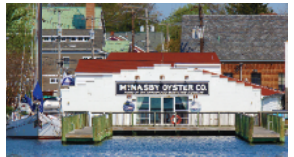
Bay view of AMM