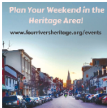
"Plan Your Weekend" graphic for Facebook