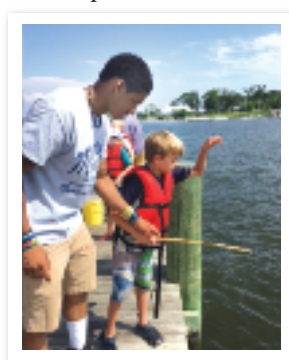
Fishing on AMM Pier

and expanding diverse programming including lectures, concerts and art exhibits. The Museum also recently opened an extensive research library that highlights local maritime heritage with onsite collections and an online digital archive. AMM is also proud of its extensive education programs, which reached capacity in 2016