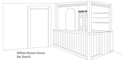
William Brown House Bar Sketch

Historic London Town and Gardens has plans to add a new interpretive feature inside the historic William Brown House. The ca. 1760 William Brown House was originally built as a tavern, and the organization plans to recreate the bar area originally located in the building's foyer. There was originally an arched pass-through opening in one of the interior walls (an architectural feature that is a significant indicator of the building's use as a tavern), which was bricked up and plastered over during a later period. Once the bar is completed and the pass-through is