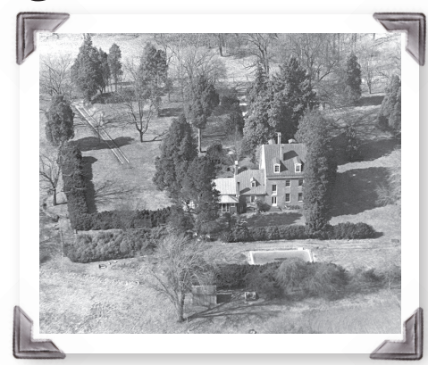
Aerial view of Sellman House (SERC)

n July 8, the Hogan Administration announced 52 matching grants totaling $2,699,532 were awarded to Maryland non-profits, local jurisdictions and non-profits, local jurisdictions and other heritage tourism organizations including museums, and historic preservation, natural resources, cultural, and educational organizations through the Maryland Heritage Areas Authority (MHAA). MHAA oversees Maryland's system of 13 locally-administered, State-certified Heritage Areas, which are places to experience – see, hear and even taste – the authentic heritage of Maryland in a unique way that cannot be experienced anywhere else. The list includes 5 new grants totaling $310,000 to local Annapolis and Anne Arundel County non-profit organizations in the Four Rivers Heritage Area.