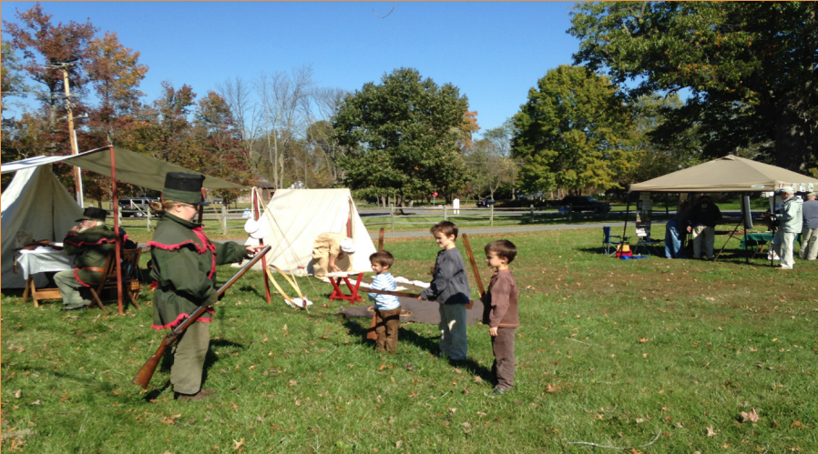
Pictured, above: Visitors unfurling the replica Star-Spangled Banner from the Maryland Historical Society. Below: Reenactor leads musket drill.

Now in its eleventh year, the Four Rivers Mini-Grant Program has generated a wide variety of new public programs, products, and services that enhance the visitor experience at sites throughout the area. In November, Four Rivers awarded grants totaling $9,355 to five heritage partners. Organizations and projects approved for FY2015 Fall Mini-Grant awards include: