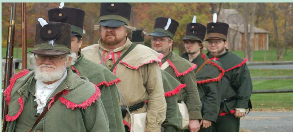
Above: The Aisquith Sharpshooters will return to take part in a reenactment of the War of 1812 Herring Creek Skirmishes on October 25, 2014.