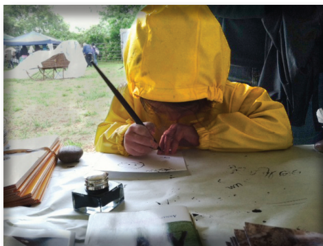
A young visitor tries her hand at writing with a calligraphy pen and ink.