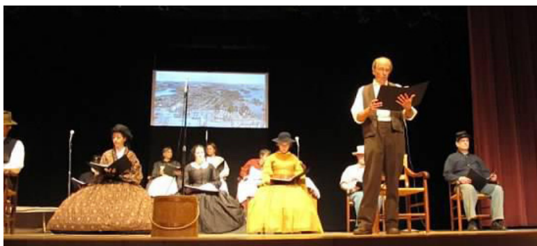
Above: Photograph of the production, "Annapolis, 1863: Are We Never to Be Free Again?"

In March, three additional Four Rivers Mini-Grants were awarded to local heritage-related nonprofit organizations as part of our spring Mini-Grant opportunity. The matching grant awards totaled $3,625 for projects totaling $13,262, making the combined total for FY2013 mini-grant funds awarded (both fall and spring) now $23,075, for total projects of $183,567. Organizations and projects approved for FY2013 Spring Mini-Grant awards are: Anne Arundel County Trust for Preservation, Inc. , with the Lost Towns Project : "The Traveling Archaeology Experience," a portable archaeology display and interactive presentation highlighting discoveries at sites in the heritage area; Caritas Society of St. John's College , in partnership with the Annapolis History Consortium : "Annapolis, 1863: Are We Never to Be Free Again?," support for a dramatic production based on primary sources from Annapolis in the year 1863; and Londontown Foundation, Inc. : "A Greener Approach to Heritage Tourism: Creating a Garden Guide and Plant Identification Signs at Historic London Town and Gardens," a brochure and plant identification markers for a multi-phase project that will provide self-guided interpretation of the gardens.