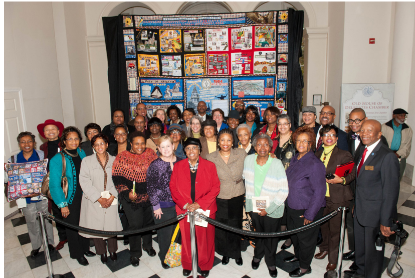
Above: Participants who shared in the making of the Maryland Emancipation Quilt gathered together in the Maryland State House for a ceremony on November 1 (see Workshops, page 3).